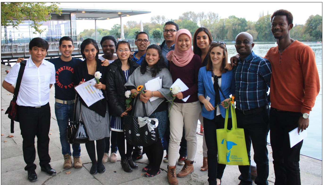
Photo: Our graduates enjoying their farewell celebration in late September at Maschsee Lake.

Congratulations to all our graduates and we wish them the best luck in their future careers and endeavours!