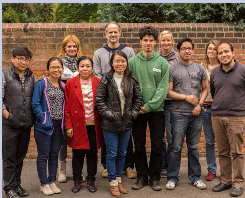
Participants of the summer school.