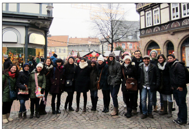
Photos (top to bottom): Schloss Marienburg, Guided tour of Hamelin, Visit to the Landtag, Visit to Goslar.