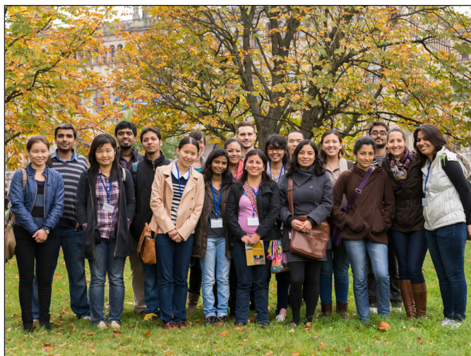
The new WATENV cohort starting WS 2014/15