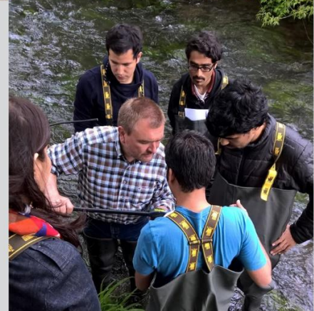
Pictures: the field trip participants, taking samples at a lake and rivers in Lower Saxony